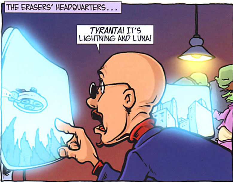
THE ERASERS' HEADQUARTERS...