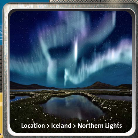
Location > Iceland > Northern Lights