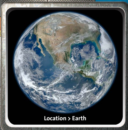
Location > Earth