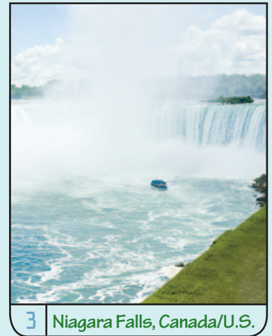
3 Niagara Falls, Canada/U.S.