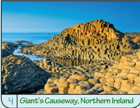
4 Giant's Causeway, Northern Ireland