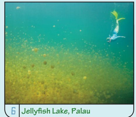
6 Jellyfish Lake, Palau