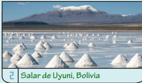
2 Salar de Uyuni, Bolivia