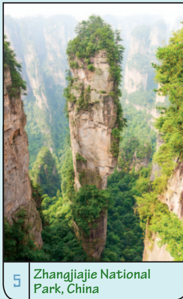
5 Zhangjiajie National Park, China