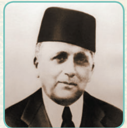
November 4, 1957 Shoghi Effendi passes away in London, England