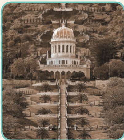
1953 Shrine of the Báb completed on Mount Carmel