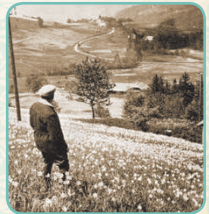
April-December, 1922 Retreat to the mountains of Switzerland