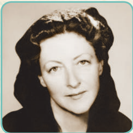
March 25, 1937 Marriage to Amatu’l-Bahá Rúhiyyih Khánum

In 1963, the national Bahá’í governing bodies of the world elected the first Universal House of Justice. Shoghi Effendi said that this nine-member council will enable the “light” of the Bahá’í Faith to “illumine the whole earth.” It is elected every five years to guide Bahá’ís in establishing global peace and justice.