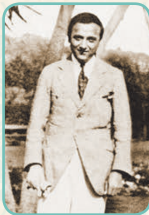
1920-1921 Studies at Oxford University, England