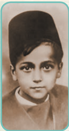
March 1, 1897 Shoghi Effendi is born in 'Akká, Israel

Faced with this immense responsibility, Shoghi Effendi retreated to the mountains of Switzerland to gain "health, strength, self-confidence and