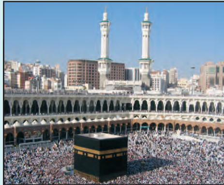
2 The Kaaba Mecca, Saudi Arabia