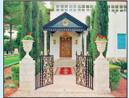
3 Shrine of Bahá'u'lláh Bahjí, Israel