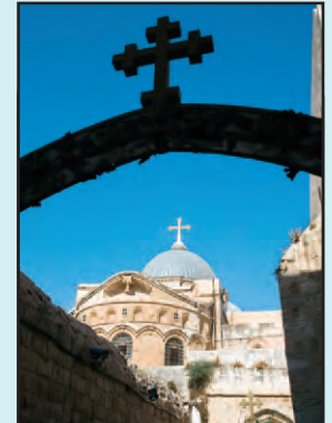
6 Church of the Holy Sepulchre Jerusalem, Israel