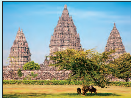
5 Prambanan Temple Compounds Yogyakarta, Indonesia