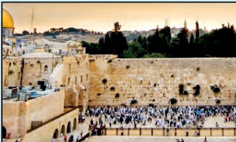
4 Western Wall Jerusalem, Israel