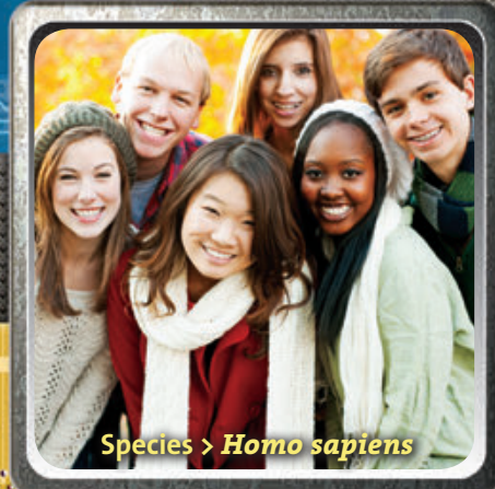
Species > Homo sapiens