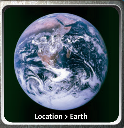
Location > Earth