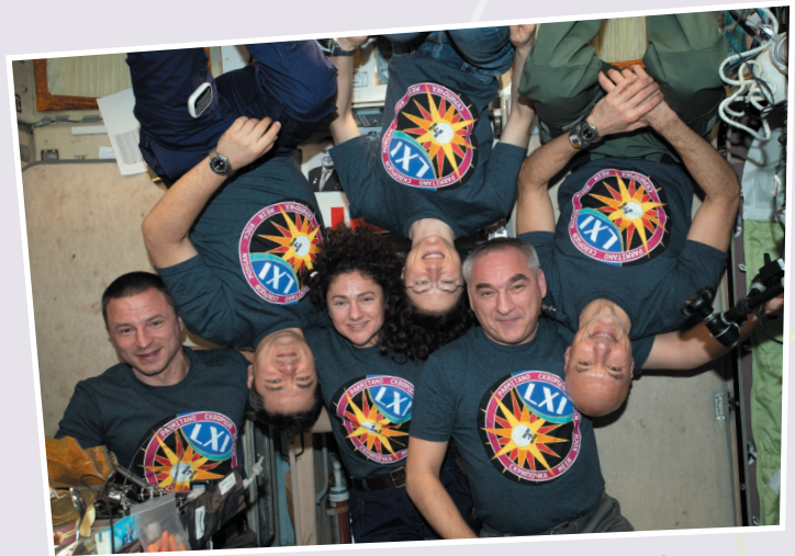
Global cooperation is seen on the International Space Station, which has had 239 visitors from 19 countries. The crew for Expedition 61 (above) was from the U.S., Russia, and Italy.