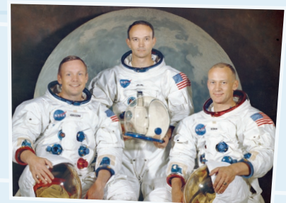
Astronauts Neil Armstrong, Michael Collins, and Buzz Aldrin