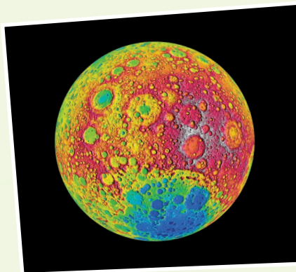
The far side of the moon (never seen from Earth) has many more craters than the near side. In this highlighted image, areas above 17,000 ft (5,182 m) are red, and those below -4,000 ft (-1,219 m) are blue.

Over the next century, the orbiting rock cooled. Eventually, its gravity pulled together the various pieces and assembled the Moon into a molten body. Over time, the Moon cooled. After countless asteroid and comet impacts, it became the dry, airless, cratered body we know today. Through tidal interactions with the Earth, its spin slowed until it became tidally locked after about 100 million years, with one side always facing Earth and the other side always facing away. It also increased its orbital distance to appear 15 times smaller in our sky. And it slowed Earth's rotation from an initial five-hour day to the 24-hour day we currently enjoy. – George