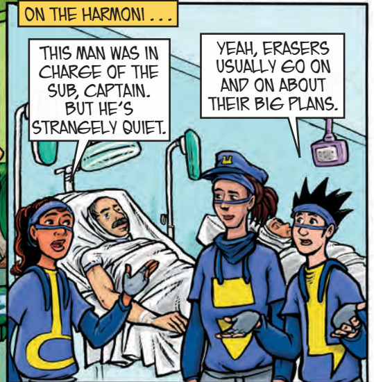
ON THE HARMONI ...

LUCKILY, THAT CREW CAN'T LEAD THEM TO MY SECRET ISLAND!