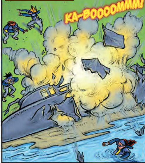
IN THE ATLANTIC ...