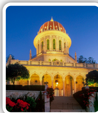
Above: The Shrine of Bahá'u'lláh near 'Akká, Israel, is Earth's holiest spot for Bahá'ís. Left: The Shrine of the Báb stands on Mount Carmel in Haifa, Israel.

Find 18 words related to celebrating the Twin Holy Birthdays with your community. Search up, down, forward, backward, and diagonally.