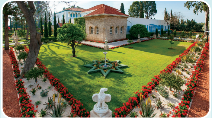
Today, Bahá’ís come from all over the globe to pray at the Shrine of Bahá’u’lláh near Akká, Israel.

For the rest of His life, Bahá’u’lláh faced exile and persecution, but He never wavered in His mission. Today, His teachings inspire millions to act with courage, stand for justice, and build welcoming communities. We can all do our part to create unity and a brighter world.