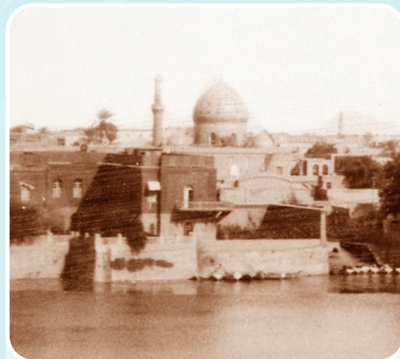
In Baghdád, Bahá'u'lláh walked along the Tigris River to reach coffeehouses, where He often shared the Báb's teachings.

on the street, He greeted them and even joked with them! They were so surprised at His calm confidence that