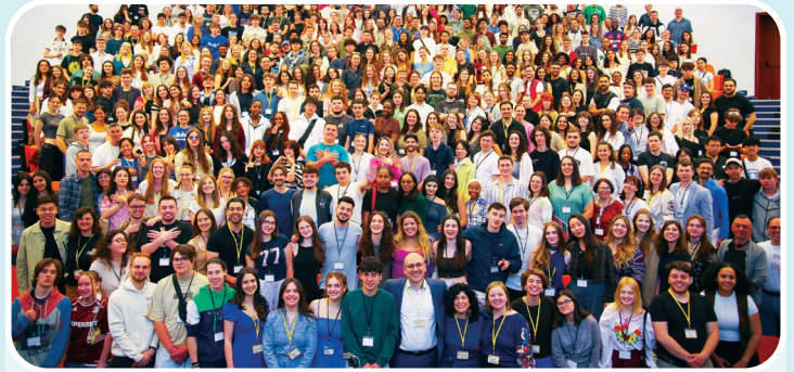
In October 2025, about 500 youth from Eastern Europe met in Bucharest, Romania, to explore building a more peaceful society.

Today, the Universal House of Justice and millions of Bahá’ís worldwide continue to promote peace. Bahá’ís create service projects and welcome everyone to gatherings large and small. In countless homes, neighborhoods, and cities, people are gradually taking steps to establish the “complete and enduring unity” of the whole human race.